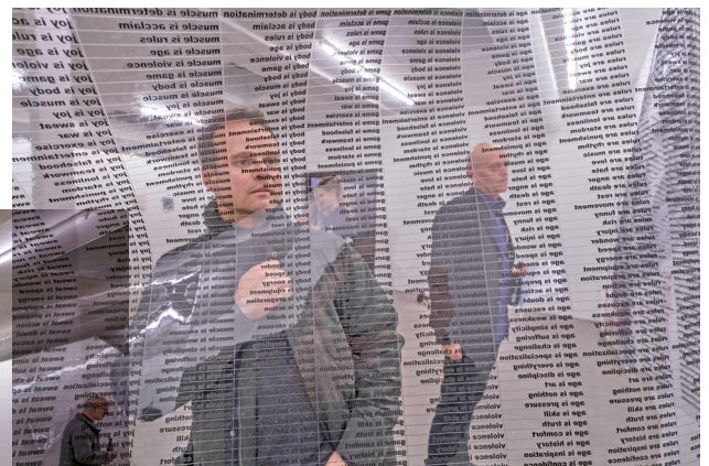
Group Show